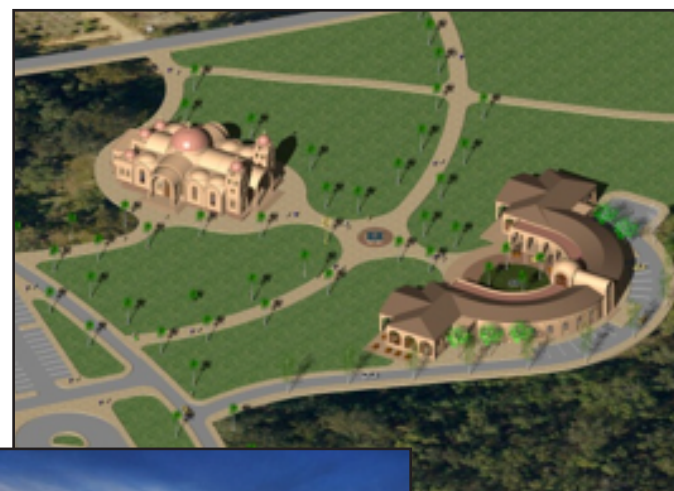
Virtual View of the Front Gate & Car park on the left.

Bishop & Abbot of St Shenouda Monastery, NSW, Australia Monday 21/5/2011