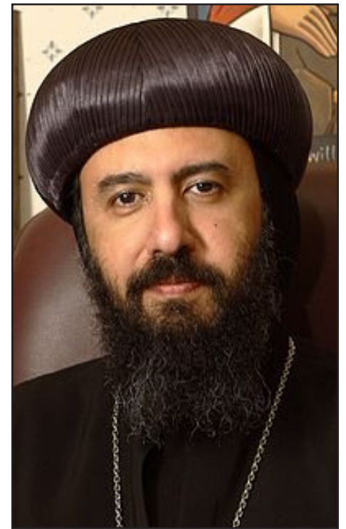
of God is eternal life in Christ Jesus our Lord (Rom 6:23). How many of us throw that gift away?

We get these checks and vouchers and gifts for things that cannot be measured by humankind, and what do we do? We throw them away. One day, we will want them - on that one day, it will make the difference between heaven and hell. We had that ticket to freedom in our hands. The gift