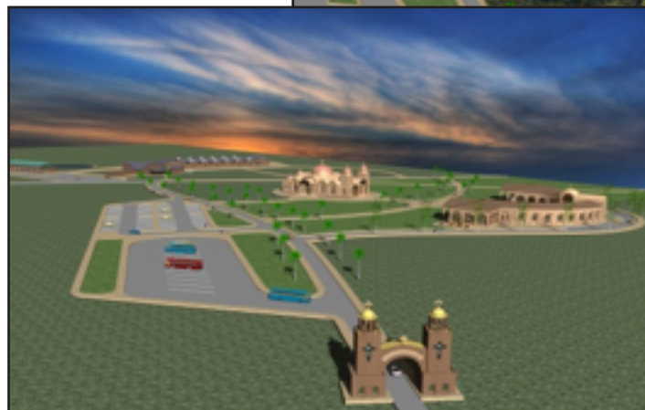
Top View of the New Cathedral & The Services Centre.

Contributions to this project are Not Tax Deductable and can be made to: Coptic Orthodox St. Shenouda Monastery Limited, Westpac Bank. BSB: 032-274 Acc No: 26-4333