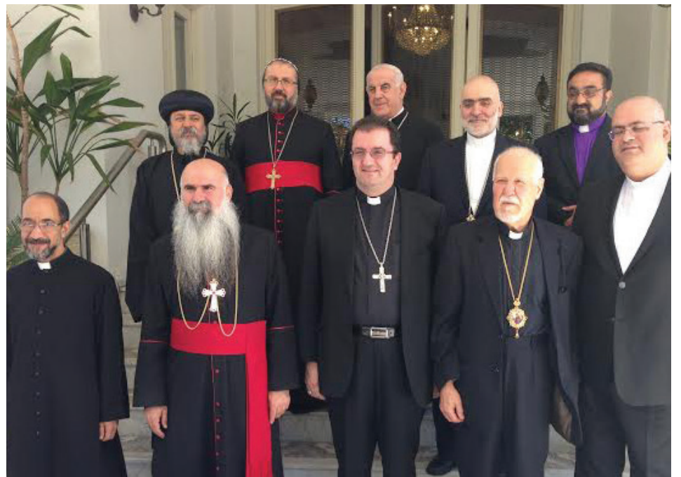
Bishops of the Eastern Churches met together to discuss issues of Australia. Thank God it was a successful meeting. May God bless our Fathers the Bishops.