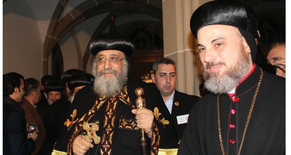
Pope Tawadros arrives to Germany in pastoral visit with Mor Philoxenos Mattias Nayis

During his eight-day visit to Europe, His Holiness Pope Tawadros II of Alexandria and Patriarch of the See of Saint Mark has opened churches in Germany and Austria. Pope Tawadros left Cairo on the 6th of December heading for Switzerland at the start of a two-week European tour.