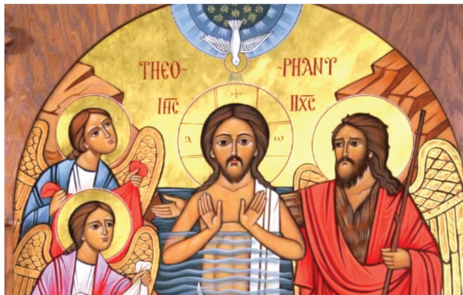
by John Maximovitch (Russian Saint)

Today the nature of the waters is sanctified. Today the Son of God is baptized in the waters of the Jordan, having no need Himself of cleansing, but in order to cleanse the sinful human race from defilement.